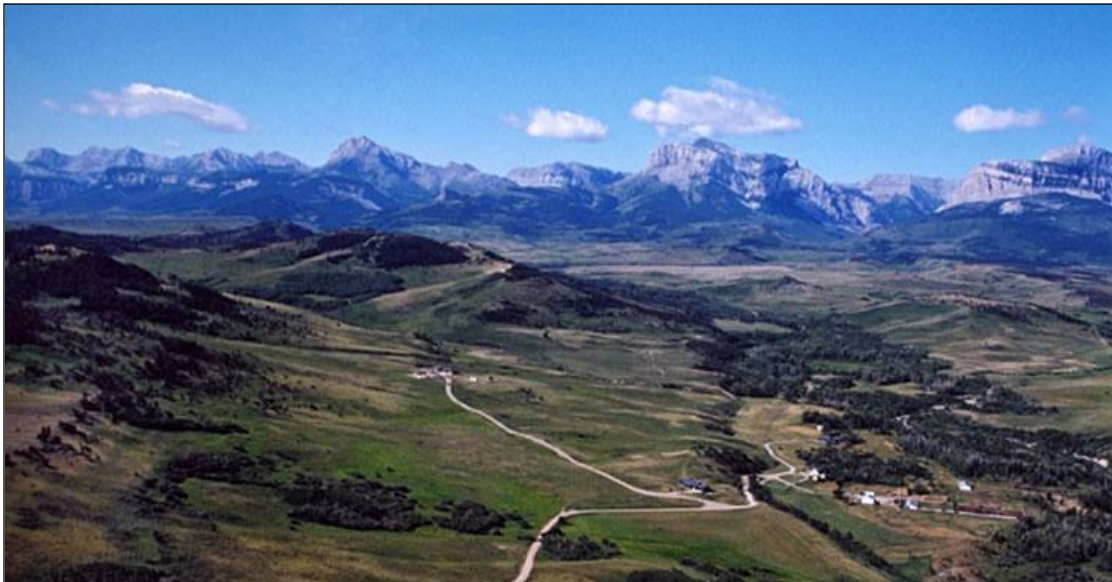
Fig 1: 6,000-acre Theodore Roosevelt Memorial Ranch - Dupuyer, Montana

The purpose of this document is to provide information for adult leaders about the Boone and Crockett Club's (B&C) Theodore Roosevelt Memorial Ranch (TRMR), the Elmer E. Rasmuson Wildlife Conservation Center (RWCC) and surrounding wilderness areas as a high adventure destination for Scouts and adult leaders in the Boy Scouts of America.